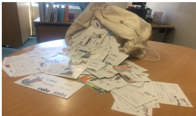
The Postbag When it Hit the Desk at Gilwell

The Postcard for Bear activity that ran right around the county in the Summer term saw around 2,500 postcards from Beavers and Cubs across the county filling a postbag that was delivered to Gilwell in July. The response from every Beaver and Cub completing a card was fantastic with some amazing ideas and advice for Bear and some really great reasons to like and enjoy being in Scouting. The team at Gilwell and Bear himself were really impressed, so much so that he has sent us back a video reply. You can see the video by following the links via the County website . You can see some analysis results of the feedback from the beavers and cubs here .